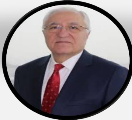
PROF.DR. ALİ OTO COVID-19 'DA KARDİYAK VE DOLAŞIMSAL ETKİLER